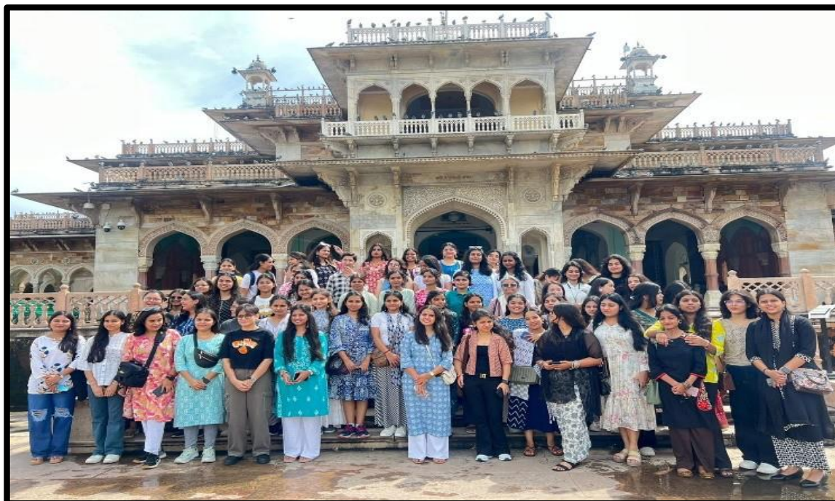
Group Photo with Students of Fifth Semester, 2024

During the trip, students visited various sites, including the Albert Hall Museum, Jantar Mantar, Birla Mandir, Moti dungri Ji, Amber Fort, Nahargarh Fort, and Patrika Gate. These visits provided them with valuable insights into the culture and geography of Jaipur at different historical stages. The arts and crafts from various countries exhibited in the Albert Hall Museum captured the students' attention. They were mesmerized by the architectural beauty and peaceful ambiance of Amber Fort, which broadened their geographical perspective. Additionally, the students conducted a tourist perception-based study at Amber Fort.