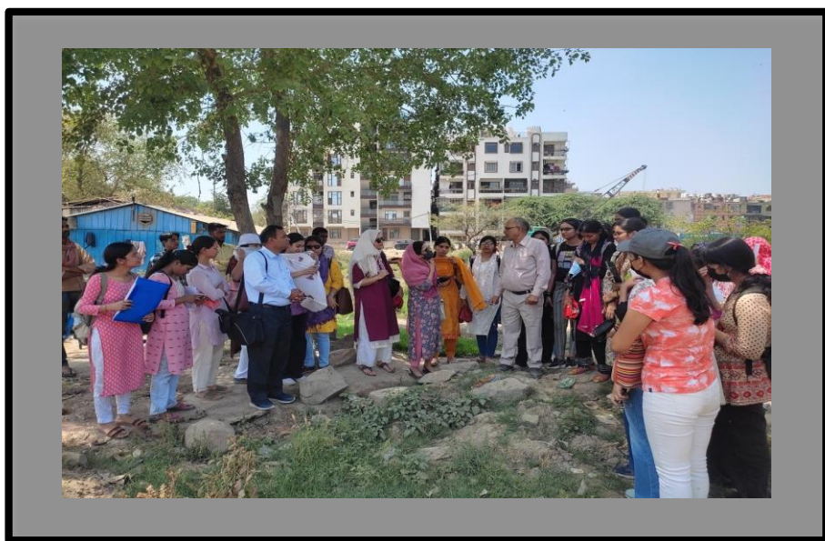
Faculty and students engaging in field work

The study highlights the importance of developing customized disaster management strategies to bolster community resilience. Key recommendations focus on improving early flood warning communication channels, increasing the accessibility of government shelters, and addressing infrastructural deficiencies. These findings support continuous efforts to enhance disaster management and resilience in flood-prone areas such as Okhla and similar communities